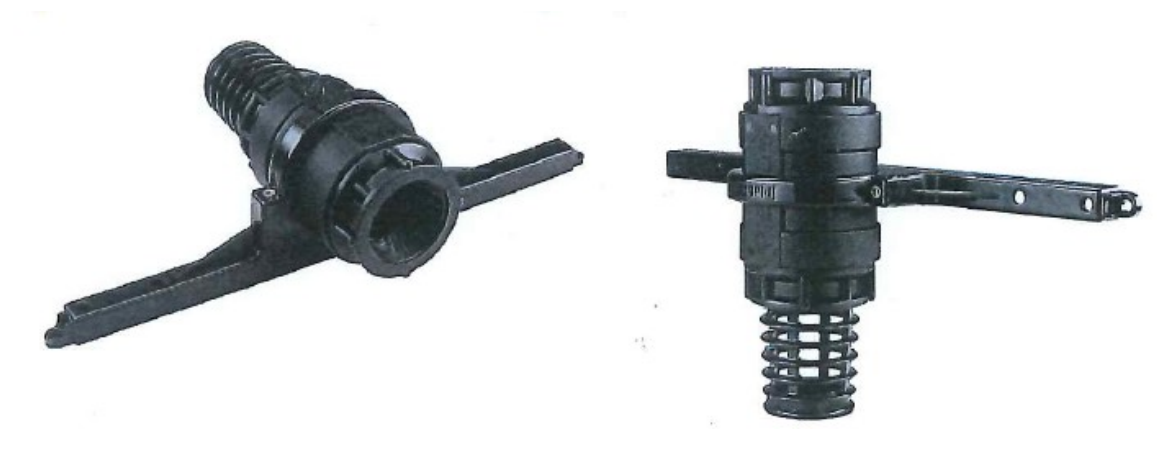
Foot Valves and floats are to be purchased separately